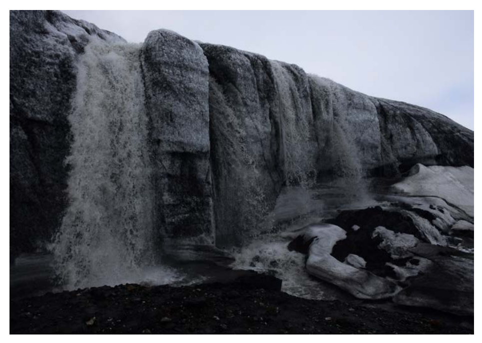
Fig. 7. Waterfall at the Hansbreen Ice Cliff

The glacier valley is limited by the Sofiekammen ridge to the east, the highest elevation of which is Wienertinden at 924 m a.s.l., and a mountain chain on the western side, with the highest point being the northern peak of Slyngfjellet (788 m a.s.l.). There are two passes connecting Hansbreen with Werenskioldbreen to the west – Kosibapasset and Bergkardet. Their elevation is below 500 m. a.s.l. The eastern mountain ridge has a mean altitude of c. 700 m a.s.l. and a relative elevation of approx. 500 m above the glacier's surface, excluding lower elevation passes. It forms an orographic barrier to air masses advecting from the east. Therefore, a distinct foehn effect can be observed during easterly winds. The mountain range bounding Hansbreen on the western side is generally 150–200 m lower than that on the eastern side (especially in the southern part), and it is dissected by tributary valleys [Budzik et al. 2012].