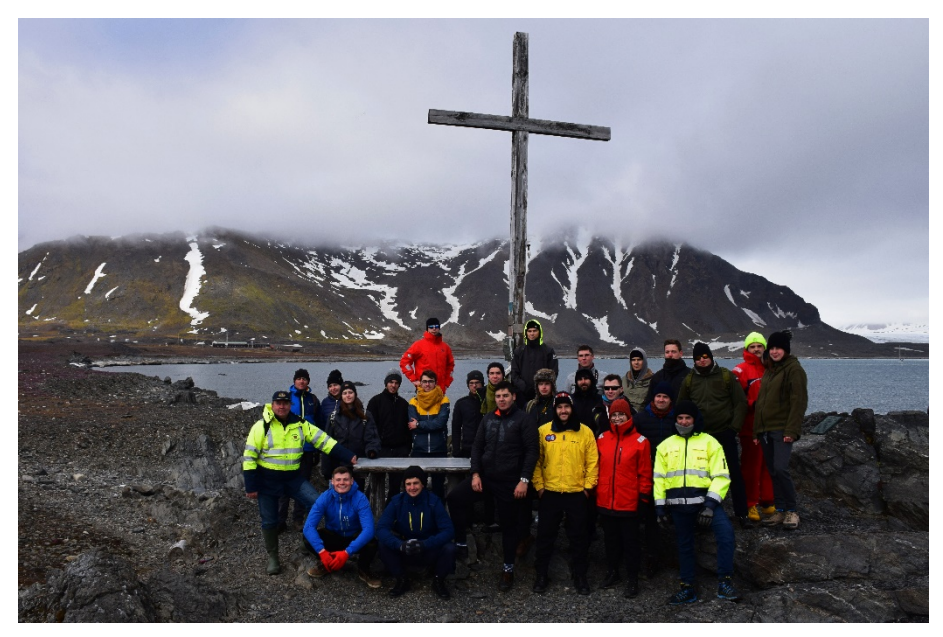
Fig. 8. Students of Gdynia Maritime University in Hornsund Fjord in June 2020

The students are mostly interested in diving to wrecks located in Hornsund Fjord to establish their precise position and to prepare accurate photographic documentation.