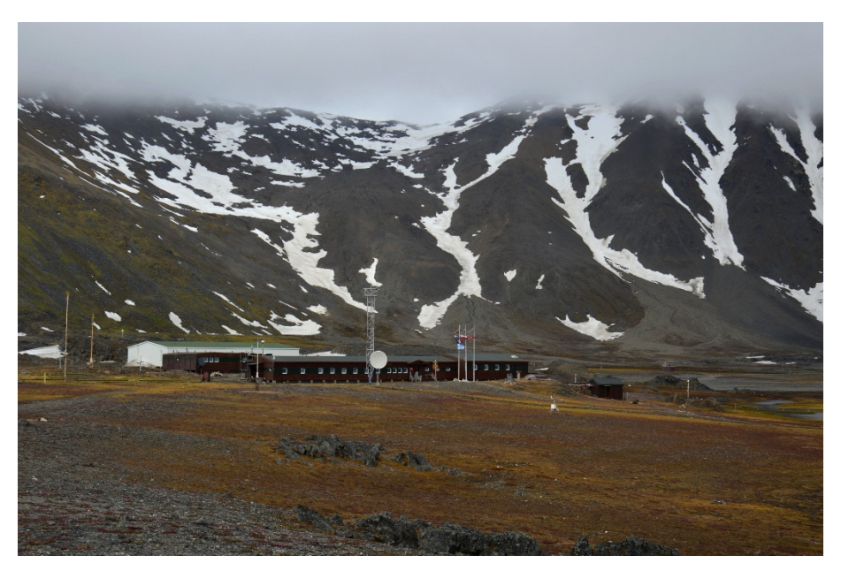
Fig. 1. Polish Polar Station in Hornsund (1)