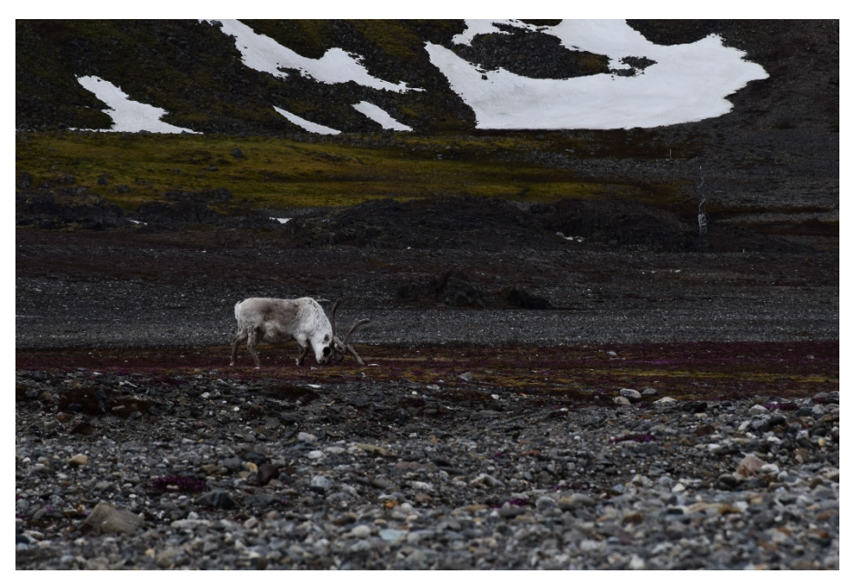
Fig. 5. Reindeer near Hornsund Station