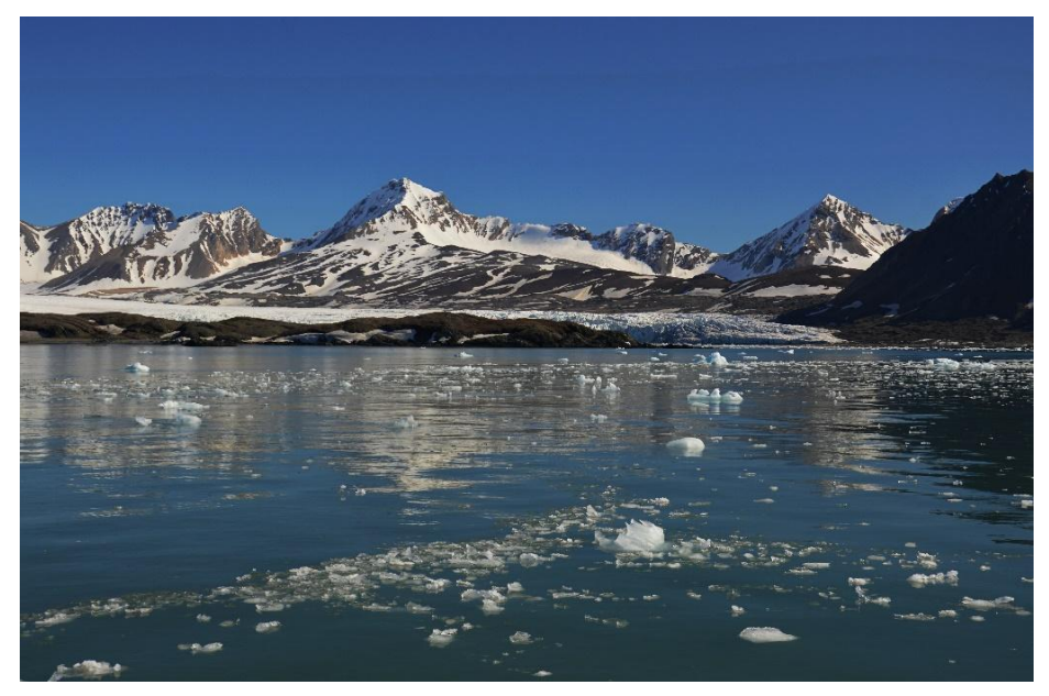
Fig. 3. Floating ice after calving of Hansbreen