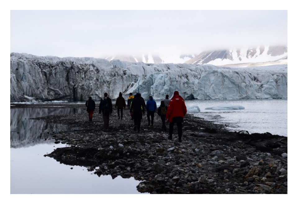
Fig. 6. Hansbreen Ice Cliff

Hansbreen is located in southern Spitsbergen (Svalbard) and flows from mountains to the north and terminates in Isbjørnahamna Bay to the south. It is a medium-sized glacier, the estimated surface area of which is circa 56 \text{ m}^2 with a 4 km-wide tongue and a 1.5 km-wide active calving front. The ice divide to the north between Hansbreen and Vrangpeisbreen is well-defined and is located at about 490 m a.s.l. [Budzik et al. 2012]. The eastern boundary between Hansbreen and its neighbouring glacier Paierlbreen is more difficult to define due to the transfusion of ice from the accumulation field to Kvitungisen (a tributary of Paierlbreen) through a glacial breach. Due to the surge of Paierlbreen in the 1990s, the glacier surface topography in the area was altered. Thus, the location of the ice divide has changed over time, and different surface areas have been reported for Hansbreen in different publications [Budzik et al. 2012].