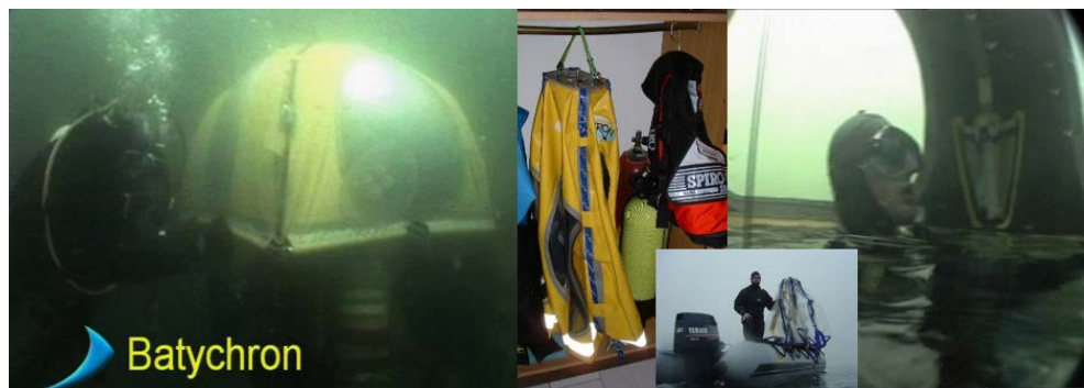
Fig. 1. From the left: Installation of the Batychron during sea trials at a depth of 20 m, the Batychron device stored in a cupboard with diving equipment and transported on a RIB to the test site. The last photo on the right shows a diver in the Batychron during sea trials at a depth of approx. 20 m

The article presents the purpose of building such a device, and also presents the issues related to its construction [Raport 2005]. The procedure for mounting the device to the seabed is also explained. The article shows the original photos that were taken by the inventors of the Batychron.